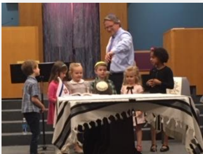
Consecration took place on Wed., Oct. 11 at 6:00pm during Simchat Torah services.

If any of you have not signed up for the Remind App, please do, so we can notify you of school closings, a change in schedule, or a special event, please stop in at the Religious School office and we'll give you instructions. With the winter approaching you might want to have that set up in case we must contact you with a change in schedule. Thanks.