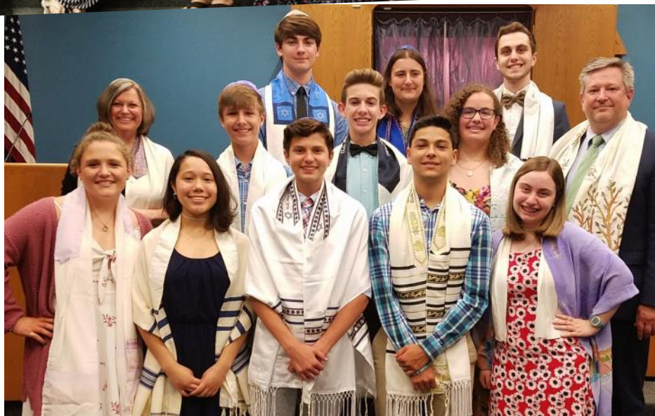
2018-19 Confirmation Class