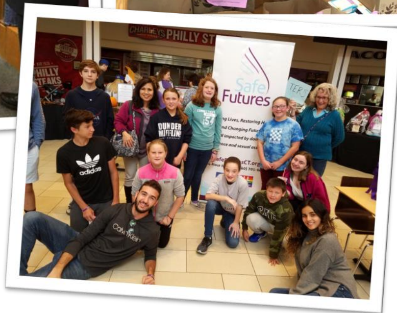
Clockwise from above: Religious School consecration, students collecting food for local food pantry, and students/teachers/ Young Emissaries participate in Safe Futures walk-a-thon.