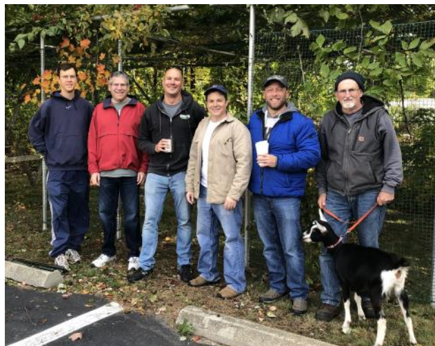
Thank you Brotherhood for erecting sukkah!