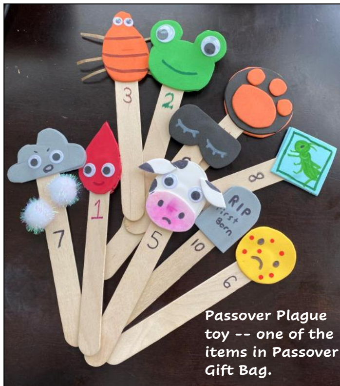
Passover Plague toy -- one of the items in Passover Gift Bag.