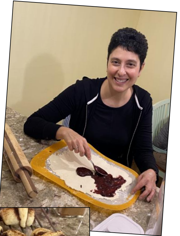
From Baking Club - rugelach served at Temple Emanu-El oneg on 1/26/23 — YUM!!