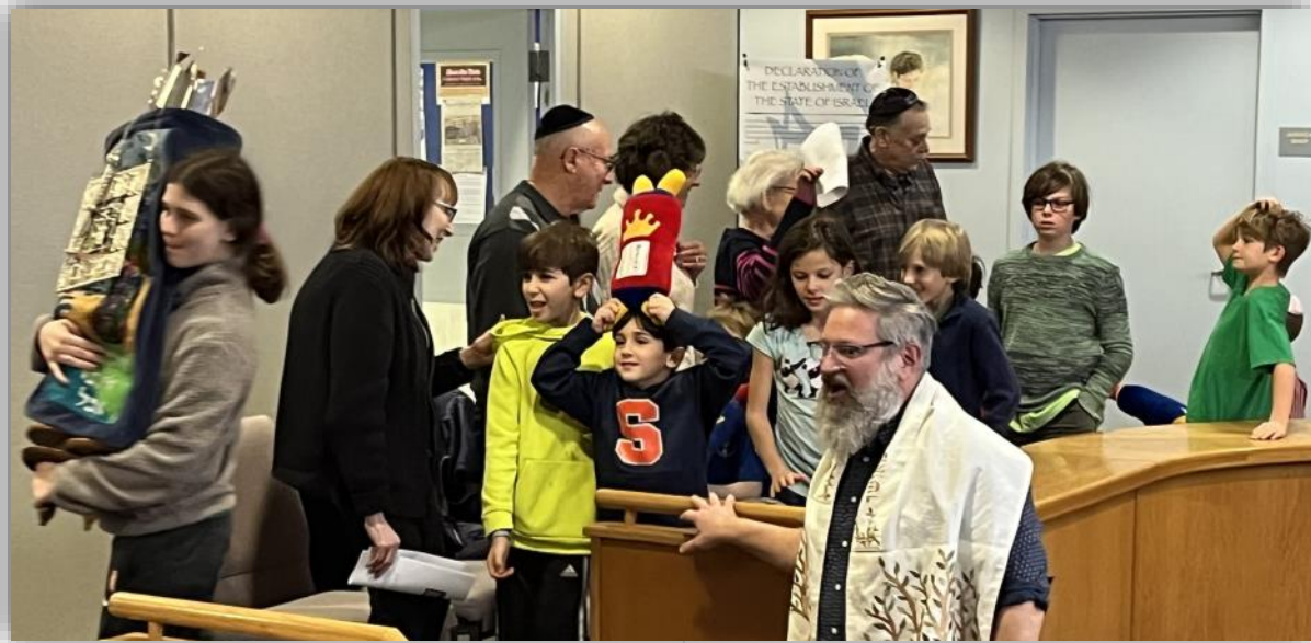
Torah procession during Share Shabbat service on Friday, Jan. 5, 2024.

... If you're planning a birthday party or baby shower but don't want to host a large number of attendees in your own home, you can rent the Temple's social hall, kitchen, and/or classrooms for your event. If you do want to plan the event at home or in your backyard but find you need to rent tables and chairs, you can also rent those from the Temple (tables are $5 per table per day and chairs are $3 per chair per day). Contact the Temple Office at (860) 443-3005 for more information.