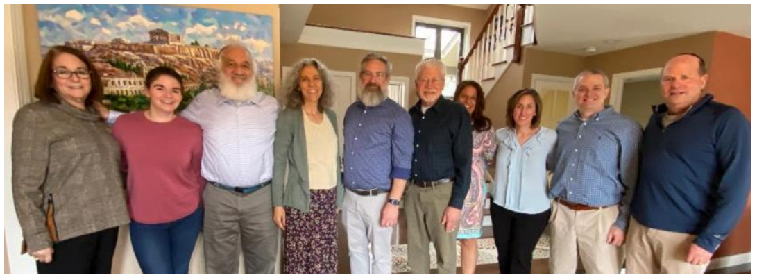
Bread & Torah hosts