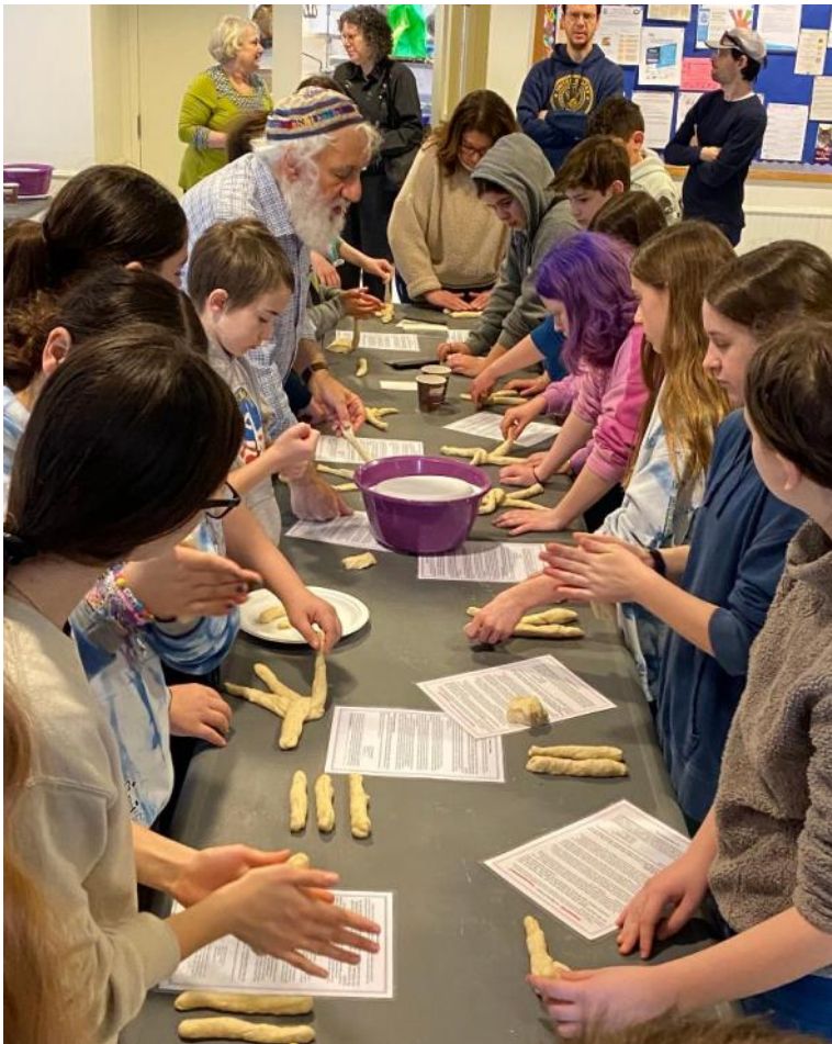
Religious school students learning to bake challah.