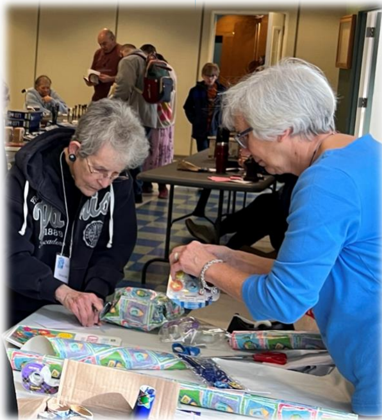
Gift wrapping at Sisterhood Chanukah Fair