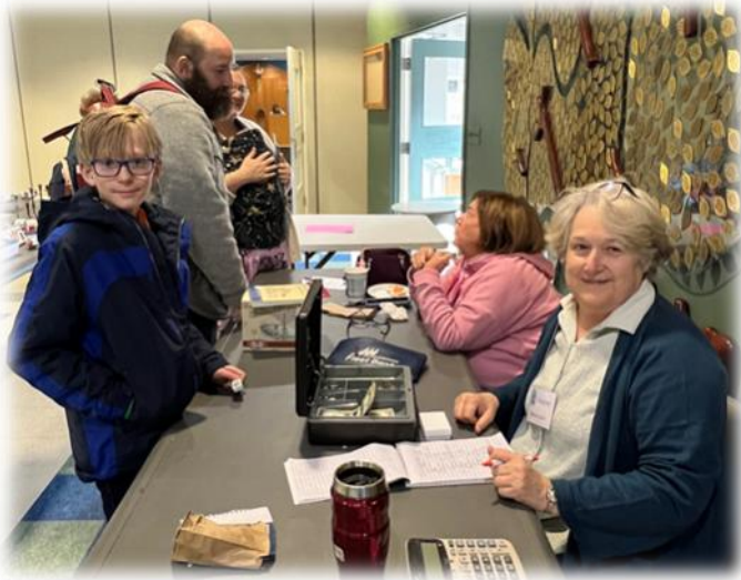
Check out at Sisterhood Chanukah Fair