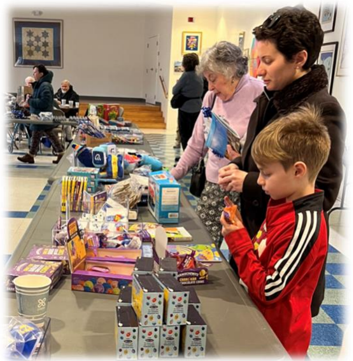
Shopping at Sisterhood Chanukah Fair