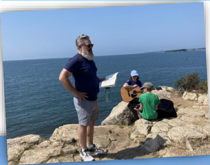
Services at Bluff Point